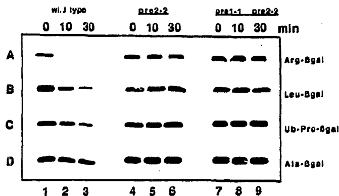
Fig. 3. Degradation of X- \beta gal test proteins in wild type and mutant cells defective in the chymotryptic activity of proteinase yscE . Cells were grown, labeled with [ 35 S]methionine and disintegrated as indicated in Section 2. Immunoprecipitation, SDS-PAGE and fluorography were done as outlined in Section 2. Labeling was done for 3 min (time point 0 (lanes 1,4 and 7)) and thereafter cells were chased with non-radioactive methionine (10 mM) for 10 min (lanes 2,5 and 8) and 30 min (lanes 3, 6 and 9). Test proteins used were: Arg- \beta gal (A), Leu- \beta gal (B), Ub-Pro- \beta gal (C) and Ala- \beta gal (D). Degradation of test proteins in wild-type cells (BR1) lanes 1,2,3; degradation in pre2-2 mutant cells (BR3) lanes 4,5,6; degradation in pre1-1. pre2-2 double mutant cells (BR4) lanes 7,8,9. Variation in band intensities of wild type and mutant cells at time-point zero are due to different exposure times of gels originating from independent experiments.